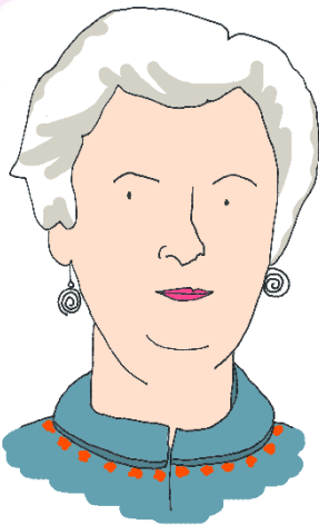
Sheila Hicks Artist and Explorer

The artist works with textiles on a MONUMENTAL scale.