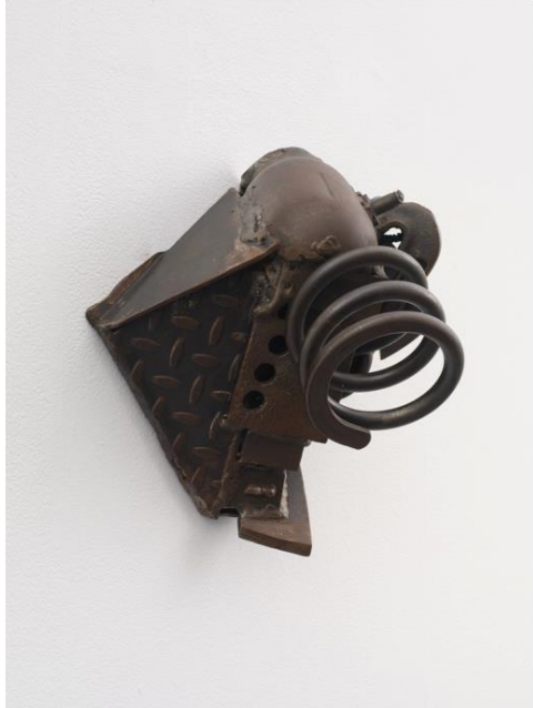
Melvin Edwards, Southern Season, 1990, welded steel, 14¼ × 14 × 10 inches.