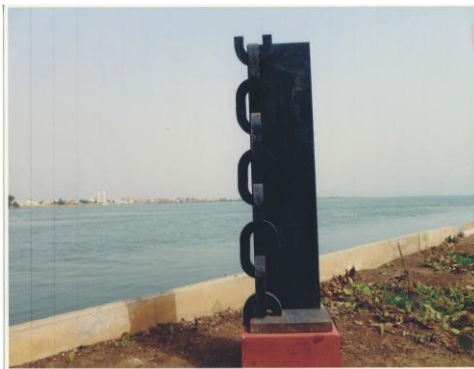
Melvin Edwards, Column of Memory, 2005, steel. Opposite the entrance to Les Comptoirs du Fleuve, Saint Louis, Senegal.

ME Yes, if I am there for a month, I usually do some work. I've been there so much I feel at home and when I feel that way, you can be sure I'm working. There are some pieces at Alexander Gray that I made in Senegal. In fact that piece of sculpture, a version of Point of Memory , we installed it on the farm. When we sold the farm, and I wanted to preserve the sculpture, I gave it to the city of Saint-Louis in Senegal in 2010. In 2012 they made me and my family honorary citizens of Senegal on account of that. The piece is in Comptoirs des Fleuve Square.