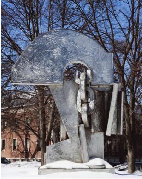
Melvin Edwards, Transcendence , 2008, stainless steel. High Street, near Skillman Library, Lafayette College, Easton, Pennsylvania. Photo courtesy the artist. © 2015 Melvin Edwards/Artists Rights Society (ARS), New York.

MB I wonder if you would talk a little bit about your connection with Cuba.