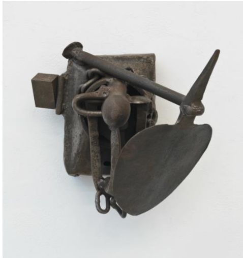
Melvin Edwards, Tayali Ever Ready (Homage to Henry Tayali) , 1981–86–88, welded steel, 8.8 × 11½ × 11 inches. Courtesy of Alexander Gray Associates, New York; Stephen Friedman Gallery, London. © 2014 Melvin Edwards/Artists Rights Society (ARS), New York.

ME Individual blacksmiths do things differently, but carving tools are not that different, they're functional. There's one tool called a tayali; I dedicated that piece to Henry Tayali from that region. He was the first modern sculptor of Zambia. His community would be Zambia and Zimbabwe. The Tayali piece was the mail card for the exhibition in Paris. It was a typical Zimbabwe farming blade you can buy in a hardware store. But the shape and form is an industrial imitation of a heart-shaped leaf that the blacksmiths made. In Senegal I asked the blacksmith I often worked with to make me a version of that.