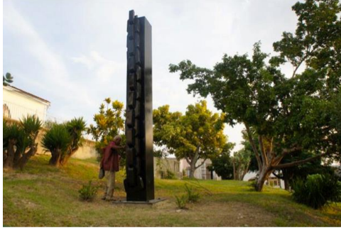
Melvin Edwards, Point of Memory , 2010, steel. The artist with the sculpture, Parque de la Beneficiencia, Santiago de Cuba, Cuba. Photograph courtesy the artist. © 2015 Melvin Edwards/Artists Rights Society (ARS), New York.

MB The column in the Cuba piece is a rectangle. When most people think of columns, they think of something round.