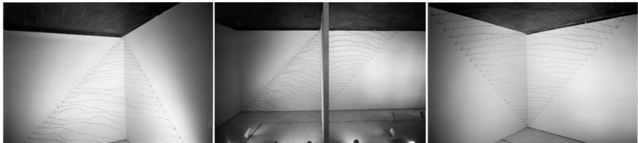
Melvin Edwards, Installation views, Whitney Museum of American Art, 1970.