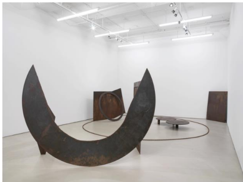
Melvin Edwards, Homage to the Poet Leon Gontran Damas, 1978-81, steel in five parts.

ME You couldn't make a decent phone call from Ghana or Nigeria from 1970 to '85. And, shit, now you can't avoid a cell phone. You've got a person walking in a field, plowing or picking peanuts, and he's got a cell phone, talking to his cousin in LA. That's the reality of now. You've got hip-hop music in Senegal; young people are crazy about it, I hate to say. But I understand it's young people's business, and it's international music. Music travels faster than almost anything else.