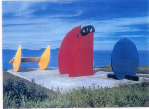
Marvin Edwards, Asafo Kra No , 1993, painted steel in three parts. The Utsukushi-ga-hara Open-Air Museum, Ueda, Nagano Prefecture Takeishi Kamihon'iri Utsukushigahara, Plateau, Japan. Photo courtesy the artist. © 2015 Marvin Edwards/Artists Rights Society (ARS), New York.

MB But you had studied painting before that.