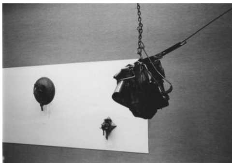
Melvin Edwards, Installation view of Sculpture by Melvin Edwards, Santa Barbara Museum, 1965. © 2014 Melvin Edwards/Artists Rights Society (ARS), New York.