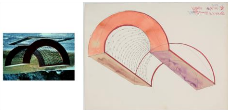
Left: Melvin Edwards, Homage to Coco, 1970, painted steel and chain, 48 × 96 × 120 inches. Right: Melvin Edwards, Study for Homage to Coco, 1970, watercolor on paper, 18.13 × 24.13.