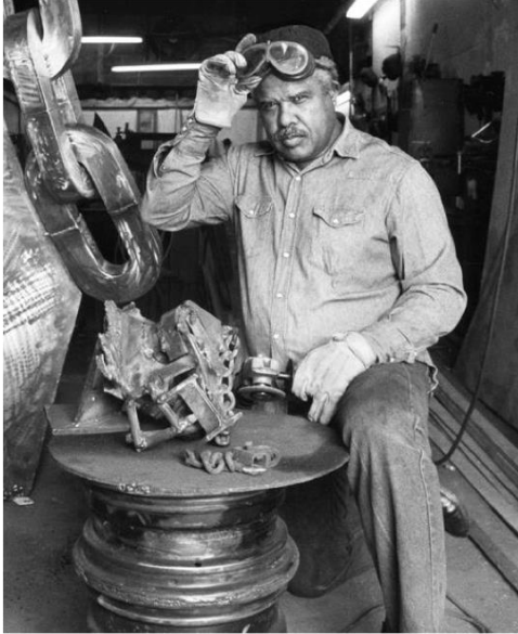
Melvin Edwards in his Studio.

MB When [David] Smith lived in Brooklyn Heights, he welded in their apartment. His wife was always running after him with a watering can, because he was in danger of burning the building down.