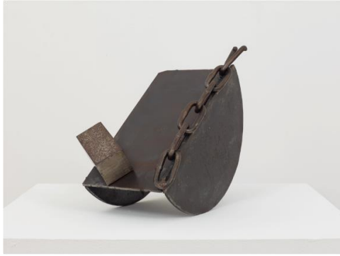
Melvin Edwards, Maquette for Before Words, 1990–91, welded steel, 9.8 × 7.3 × 9.8 inches.