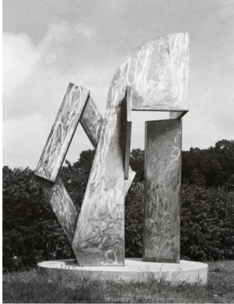
Melvin Edwards, Safe Journey, 1991-93, stainless steel, State of New Jersey Motor Vehicle Services Inspection Station, 109 New Jersey 36, Eatontown, New Jersey.

On that trip I could see that Cuba was having a hard time. But it was much worse when we were there later. We went back a couple of times, and on the trip in '91 [after the USSR fell apart], they were having one hell of a difficult time; people were thin, people were ashamed to invite you to their house because they couldn't offer you anything. When I went to friends' houses, I just brought a bottle of rum from the hotel so we could have drinks. I didn't want to make them uncomfortable. One of our friends, a sculptor, was angry at the whole socialist thing, because he felt the promises hadn't come through. He felt that if he were out of the country, his art life would have been better, but he'd done better than some people.