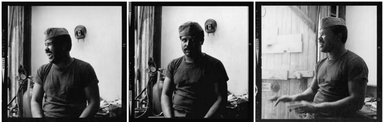
Portraits of the sculptor, Melvin Edwards, October 1965.

BOMB's Oral History Project documents the life stories of New York City's African American artists. [ Download as a PDF, EPUB, or MOBI file ]