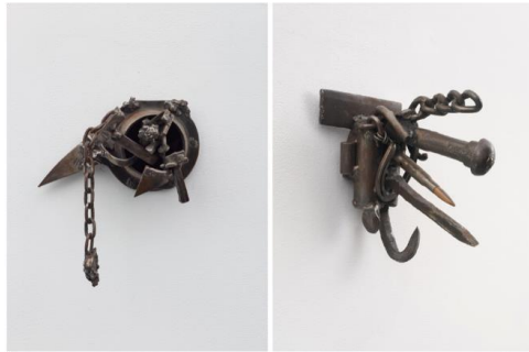
Left: Melvin Edwards, Some Bright Morning, 1963, welded steel, 14½ × 9.3 × 5 inches. Right: Melvin Edwards, Grenada, 1983, welded steel, 10.13 × 7½ × 9.88 inches. © 2014 Melvin Edwards/Artists Rights Society (ARS), New York.

keep them oppressed and they won't ever do anything..." Since then, the police hide if they get a call, because the next generation became very violent. I don't happen to like that, but I realize that's the dynamics.