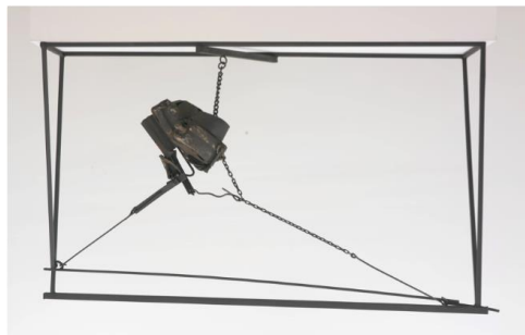
Melvin Edwards, Chaino, 1964, welded steel and chains, 62 × 102 × 26 inches.

ME Oh yeah, very much. There's no reference to Smith, no reference to Caro, or to anybody who worked with steel, and yet it was steel. It wasn't welded, but what I had learned from using steel was that where things were joined, like in a chain, it's manipulated. A lot of times, in the end, it doesn't look like it's affected by gravity. On the chain curtains, gravity is pretty clear. In the smaller works, like the Lynch Fragments , sometimes gravity's effects are clear. Or there can be a fixed placement of the chain or a combination of the two that determines the value of the form. There can be suspension. As soon as you add elements with fairly specific weights to preexisting linear geometry, it affects their placement in space. Every time you add form, it changes the whole spatial configuration of a piece. Like when there's an eclipse; the light moves, and it changes the whole composition of the sky. Now how that one, two, three, four changes—I can't describe it. I use my own intuition and some awareness of Antonio Gaudí's use of chains in architecture. Early on in the '60s, I bought a book on Gaudí. How he developed structures for arches by suspending chains from two points. I've paid much more attention to him than Caro. I've actually developed it using gravity, but then you weld it so it's fixed.