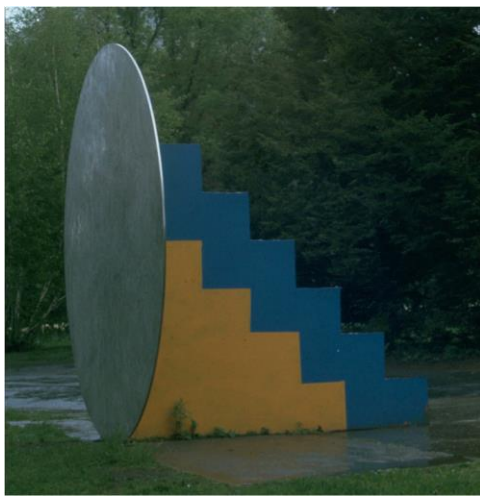
Melvin Edwards, Homage to My Father and the Spirit, 1969, stainless steel and painted steel.

ME End, but also halfback. We were exactly the same height, but at that age, he was more like a hundred and seventy pounds. He never gained a lot more weight. I'm the one who gained the weight. If I were a hundred and seventy, I guess I'd look very much like him.