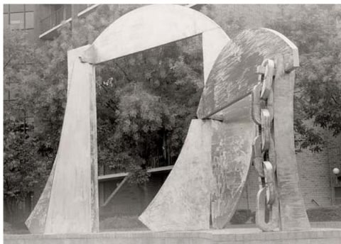
Melvin Edwards, Out of the Struggles of the Past to a Brilliant Future , 1982, stainless steel. Courtesy Alexander Gray Associates, New York; Stephen Friedman Gallery, London. © 2014 Melvin Edwards/Artists Rights Society (ARS), New York.

ME Yes, and you could say it's really six countries of twenty or twenty-five million people each. It could easily be that set of units. But I think it's better that they struggle to hold themselves together. It's kind of like, are you going to be a nation-state, like the United States, or are you going to be like the countries in Europe? As for Africa as a whole, Nkrumah's idea of a United States of Africa, that's a dream for the future. There are regional organizations that do some of that kind of thing, some of that connecting, like the European Union is doing for Europe.