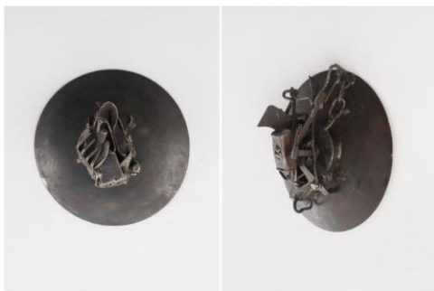
Left: Melvin Edwards, Diamniadio, 2004, welded steel, 21 × 21 × 8½ inches. Right: Melvin Edwards, Wayou Tugge, 2014, welded steel, 15¼ × 15¼ × 6¼ inches. ©2014 Melvin Edwards / Artists Rights Society (ARS), New York.

The other thing is that composition was always very important to me. Early on, when I was studying art, the Renaissance principle of six heads to a figure or whatever it was—well, once you're working abstractly, it's not that kind of dynamic. One of the things I always thought about Jacob Lawrence was that he was a great composer. I still feel that way. Now, I would say his